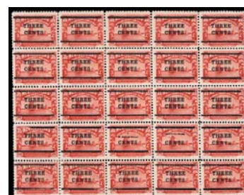
1920 Surcharge; partially missing