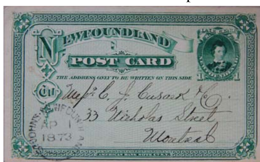
First Day Use; message side confirms date