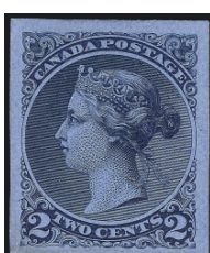
NSSC TESQ issue

1897 Queen Victoria - Diamond Jubilee issue