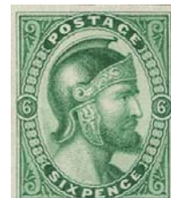
NSSC CPEX2 issue

1868 - 1875 Queen Victoria - Large Queen Trial Essay issue