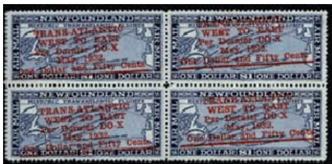
NSSC AM 13 a (dramatic slanting example criteria)

1932 WAYZATA ESSAY (AUGUST 11) ENGRAVED. NO WATERMARK. PERF 12 X 12