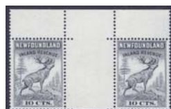
1964 two holes in gutter