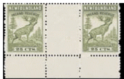
1942 holes across gutter