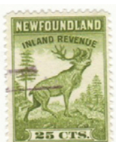
1942; 1964 issue