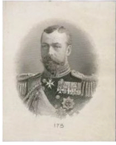
NSSC R 16dpl