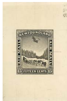
NSSC AM 7dp15