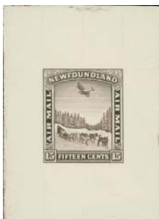
NSSC AM 7dp19