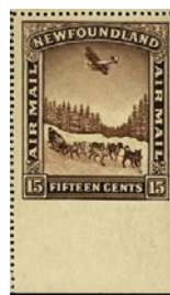
NSSC AM 7 c