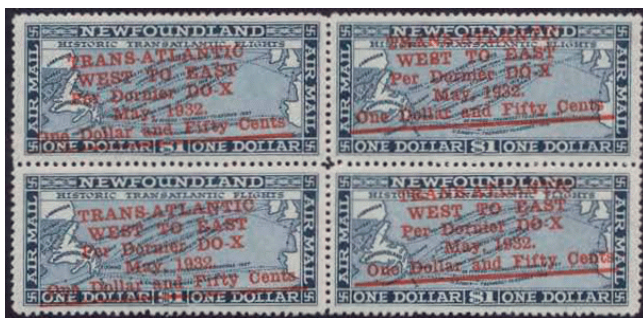
NSSC AM 13 a (dramatic slanting example criteria)