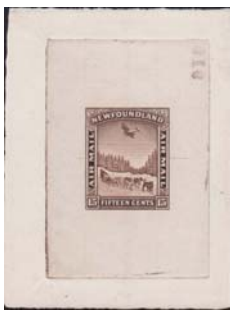
NSSC AM 7dp14