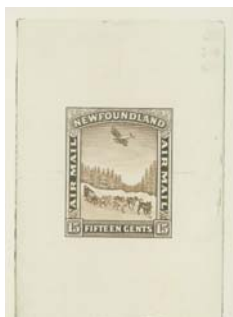
NSSC AM 7dp13