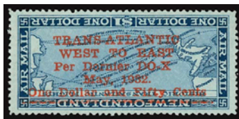
NSSC AM 13 B