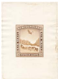
NSSC AM 7dp12