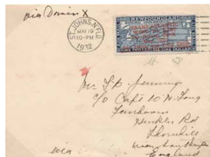
NSSC AM 13 a (dramatic slanting)