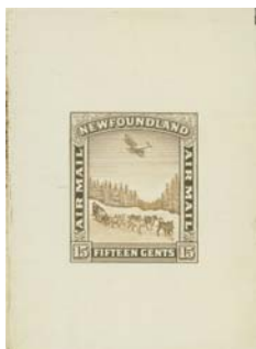
NSSC AM 7dp18