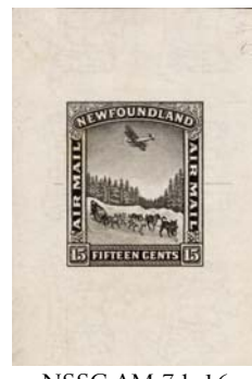
NSSC AM 7dp16