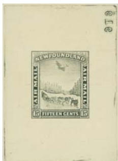
NSSC AM 7dp17